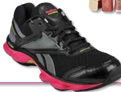
Reebok Pink Ribbon RunTone Ready, $99.99, reebok.com