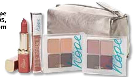
L'Oreal Color of Hope Cosmetic Bag Set, $29.95, drugstore.com