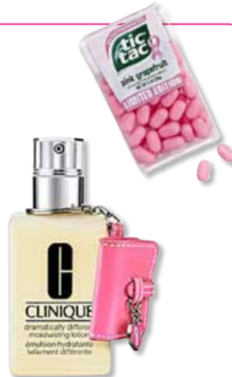
Clinique Dramatically Different Moisturizing Lotion, $36, bloomingdales.com