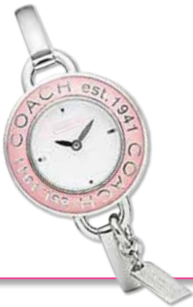
Coach Phoebe Breast Cancer Awareness Watch, $298, coach.com

Stock up on the season's hottest makeup colors with the L'Oreal Color of Hope Cosmetics Collection. The nude gloss and orange and burgundy eye shadows are right on trend. For each bag sold, which includes a gloss, lipstick and two eye shadow palettes, L'Oreal will donate $5 to the Ovarian Cancer Research Fund. For items purchased individually from the collection L'Oreal will donate $1 to the fund.