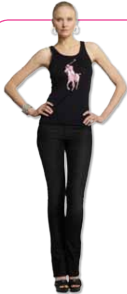
Big Pony Cotton Jersey Tank, $78, ralphlauren.com

Look like a star in these pumps designed by luxury shoe designer Stuart Weitzman who has expanded his unique offerings with the Young Hollywood Cares Collection. Weitzman partnered with four starlets—Scarlett Johansson, Hayden Panettiere, Olivia Palermo and Michelle Trachtenberg—to create a line that benefits ovarian cancer research.