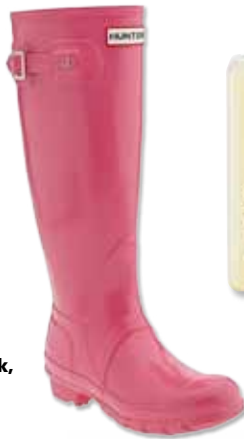
Hunter Original Tall High Gloss Rainboot, $125, nordstroms.com