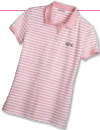
Breast Cancer Research Foundation 2 Button Stretch Pique Polo, $85, lacoste.com