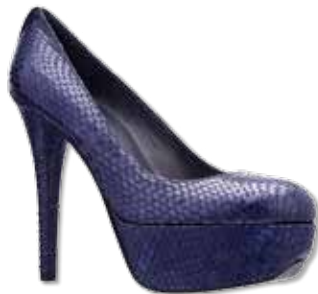
Michelle Trachtenberg pumps by Stuart Weitzman, $425, stuartweitzman.com