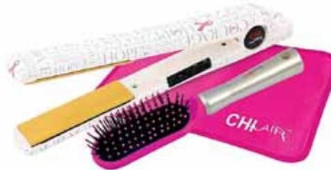
CHI Air Classic Tourmaline Ceramic Flat Iron - Breast Cancer Awareness, $99, target.com

The set includes the lotion and a mini photo keychain with a breast cancer charm. $10 from the sale of each bottle will be donated to the Breast Cancer Research Foundation.